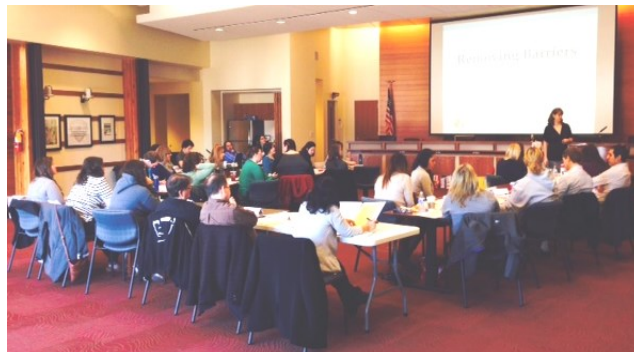
Educators in year 1-6 of their career gather to participate in Sparks.

The Professional Negotiations Act of 1965 recognized the right of employee organization to represent certificated employees in their relations with school districts? Prior to that, teachers did not have collective bargaining rights.